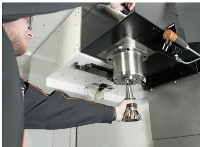
Enhanced operator ergonomics